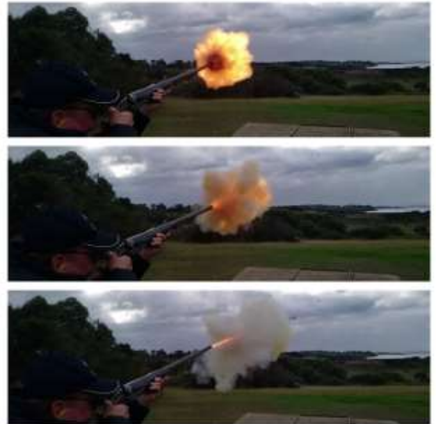
I Hollis, 8 bore x 3¼" circa 1885