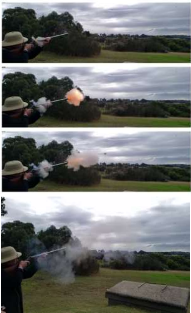
W & J Rigby, 14 bore muzzle loader sold in 1838