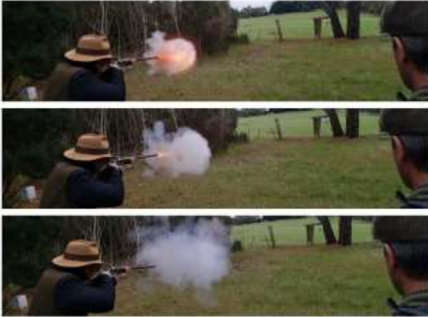
Claybrough & Johnstone 12 bore circa 1904